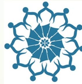
IRAN Public Private Dialogue Council (PPDC)